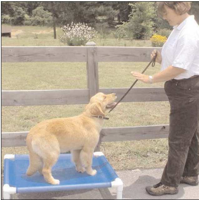
Photo 6: Cat is holding the leash properly, but needs to give Cinda a little more slack to allow her to make the mistake of stepping off the bed. The bed is made of a PVC frame and an easily cleaned, lightweight sling.