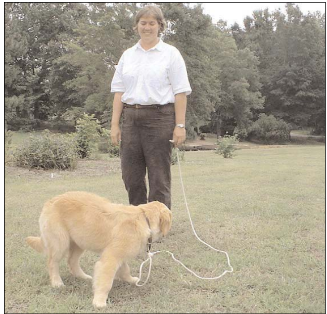
Photo 5: Cinda sees another puppy across the yard and decides to stay close to Cat instead of going for a visit.

graph (photo 6). When he steps off the place, step toward him, tell him he’s wrong, “No,” and repeat “Place” as you use your leash to return him to the bed (photo 7).